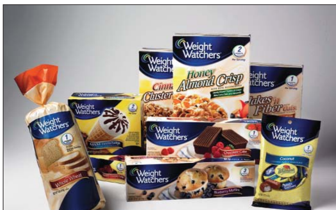
Marina Maher Communications introduced a new line of food products for Weight Watchers. Extensive media coverage placed Weight Watchers snack cakes and ice creams into the top 20 new brand sales list for Wal-Mart.