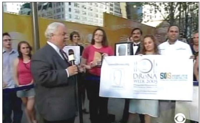
Kellen Communications staff recently appeared on the CBS Early Show with members of the Distinguished Restaurants of North America (DiRoNA) to promote DiRoNA Week, a national initiative where award-winning restaurants offered a special prix-fixe menu, donating a portion of proceeds to Share Our Strength, a nonprofit organization that fights childhood hunger.