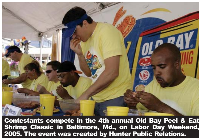
Contestants compete in the 4th annual Old Bay Peel & Eat Shrimp Classic in Baltimore, Md., on Labor Day Weekend, 2005. The event was created by Hunter Public Relations.