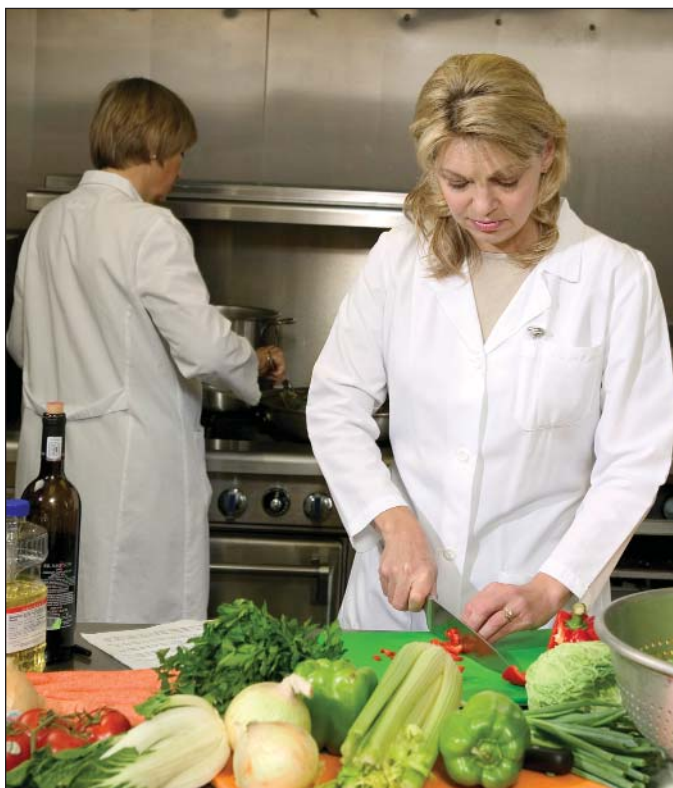
The culinary center at Publicis Dialog developed 'unexpected' recipes for ZESPRI New Zealand kiwifruit, earning 251 million media impressions during the 2005 kiwifruit season.