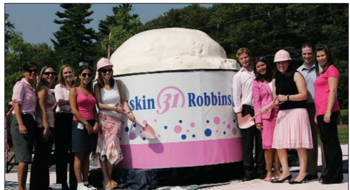
Schneider Associates worked with Baskin-Robbins ice cream and world-renowned ice sculptors to create a 7,000-lb. Baskin-Robbins ice cream scoop for potential inclusion in the Guinness Book of World Records. The scoop was unveiled during the Baskin-Robbins' 60th birthday celebration in September, at the company headquarters in Canton, Mass.