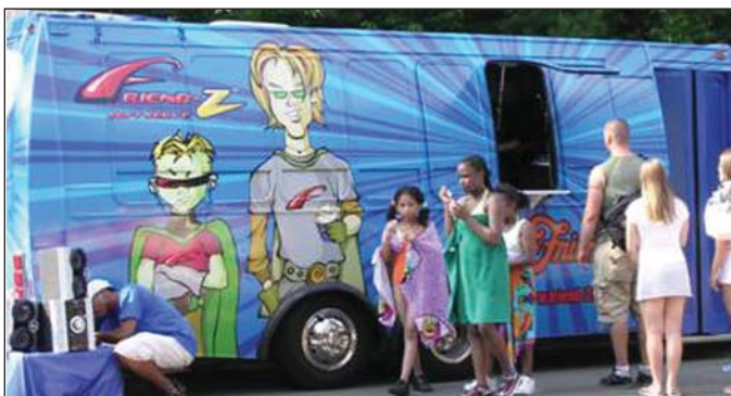
Friendly's "Mobile Marketing Sampling Tour" provided relief from the heat last year with free samples of ice cream to generate awareness of the company's new Friend-Z products. The campaign was spearheaded by Laughlin/Constable.