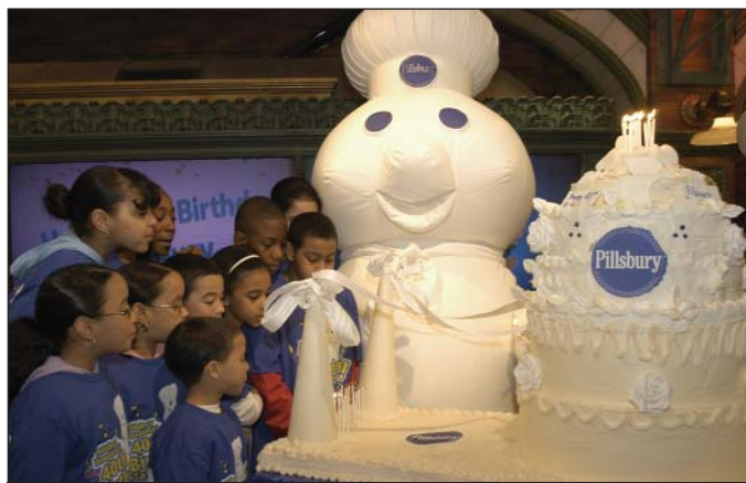
Cohn and Wolfe helped one of America's most beloved icons, the Pillsbury Doughboy, celebrate the big 4-0 and kicked off a year long celebration in New York City with a birthday bash in Times Square. Special guests, including kids from the Bronx, came out to send him off on a cross-country 40th Birthday Taste Tour to benefit Boys & Girls Clubs of America.