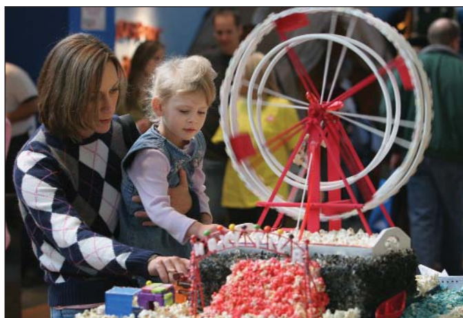
McDowell & Piasecki produced a creative market event for Jolly Time Popcorn in Chicago. The campaign, introduced during National Popcorn Month, included ten sculptures of famous Chicago landmarks created by culinary students and exhibited at Chicago Children's Museum. The campaign increased overall brand awareness and generated more than 10 million media impressions nationwide.

PR & marketing for food and nutrition, beverage, consumer