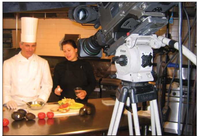
Lewis & Neale provides video production service for a popular television cooking show.

Lee & Assocs. offers strategic planning, program evaluation, media relations, product launches, consumer education, recipe development, special events, crisis management and corporate PR services to its food & beverage client roster.